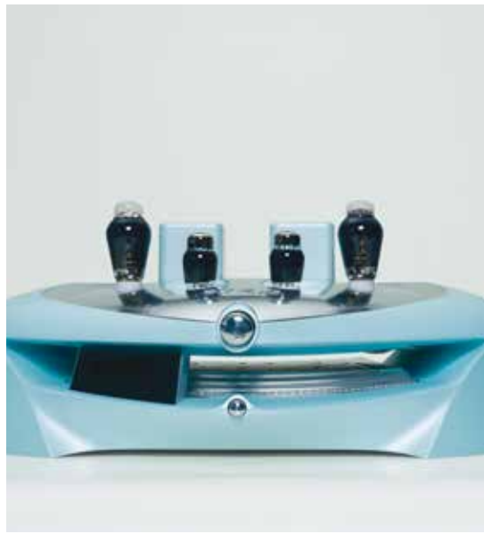
On this page, two photos of systems by ASKJA. On the opposite page, a Y-der speaker by YAR, in personalised finish including quality timber

I can't help mentioning a turntable which looks as good as it sounds. Mag-Lev Audio is the world's first levitating turntable. It uses magnets to suspend the platter in the air. It is a Kickstarter success story, and the first backers will receive their turntables in August 2017. Taking old-fashioned vinyl to new heights. ■