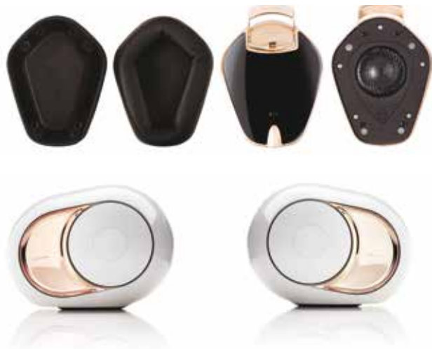
On this page, top, the levitating turntable by Mag-Lev Audio; centre, luxury headphones by Pryma; bottom, Gold Phantom speakers by Devialet. Opposite page, top, Pryma headphones, detail of the snap-adjusting headband; bottom, a sound system by ASKJA incorporating psychoacoustic studies